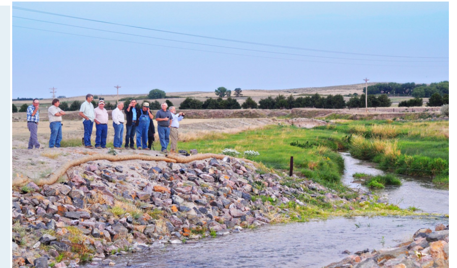
Colorado's RRWCD Board Members watching augmentation water go into the Republican River. This water is upstream of Swanson Reservoir.

Like Nebraska, Colorado's depletions to the stream from ground water pumping continues to increase each year. This requires more and more augmentation water pumped to offset those depletions to the stream that are in excess of Colorado's Compact water supply.